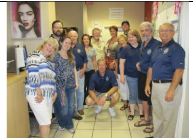
The LVSW Rotary Back to School Shopping team