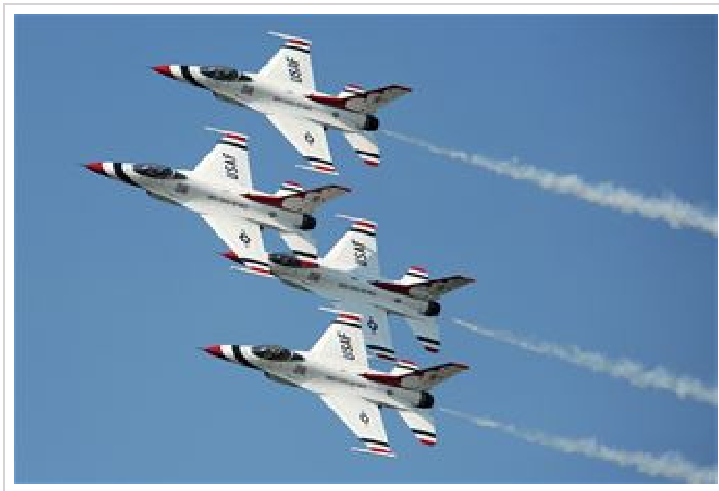
United State Air Force Thunderbirds Based at Nellis Air Force Base, Las Vegas Nevada

December 17, 2012 2:pm to 4:30pm Open to 50 attendees Must be over 13 years old