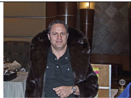
One word: Unfortunate.