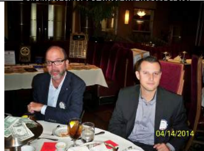
These guys are up to no good.