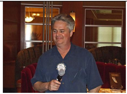
Mark Rowley grins as he's about to get a question wrong