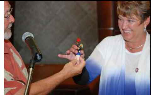
Too many jokes, not enough room.