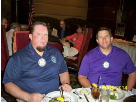
Just too many jokes to count. Make your own up.