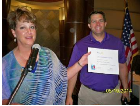
We got an award!!!! For what, we're not sure, but we got an award!!!!