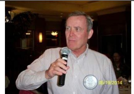
Still no smile ...