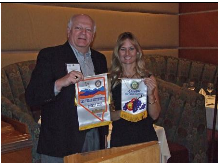
A Grimsby, Ontario banner!