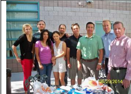
Group Happy Feet shot!