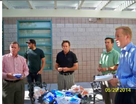
Is it me or do they ALL look confused.