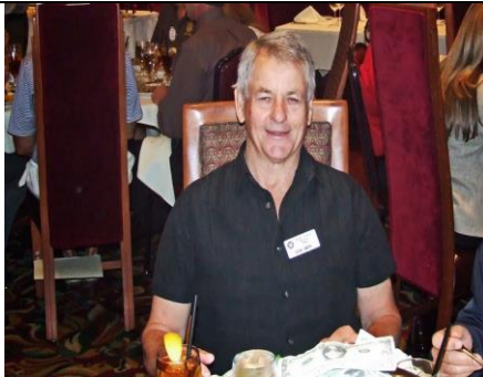
This visiting Rotarian looks like he's been having a good time all week.