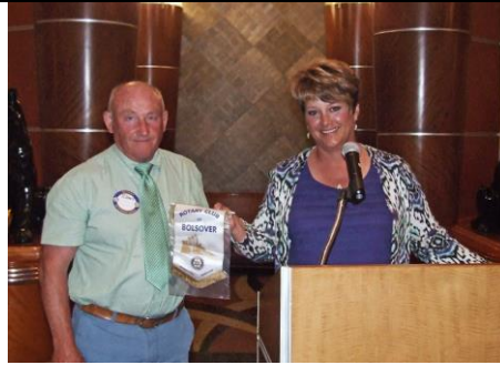
Is that a sea green tie mixed with a mint green shirt and blue pants???