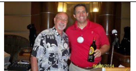
Yep. It was the wine.